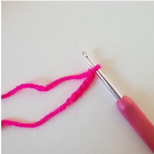
1. Start med å lage 5 luftmasker