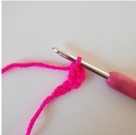
2. I tredje luftmaske hekles 1 stv