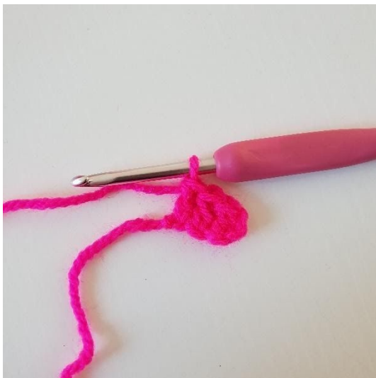
3. Hekle stv i de neste 2 lm. Du har nå heklet din første pixel