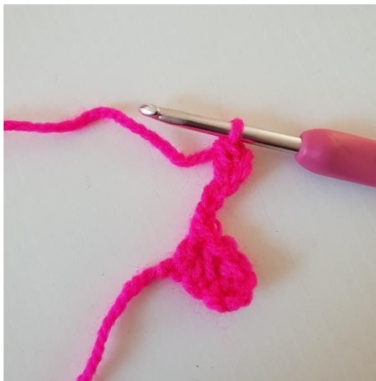
2. Hekle 1 stv i tredje lm fra nålen