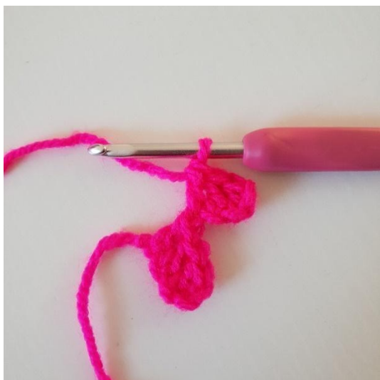
3. Hekle stv i de neste 2 lm. Nå har du enda en pixel.