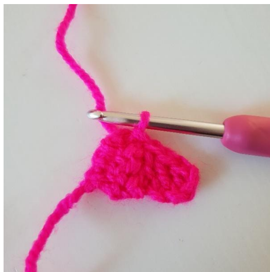
4. Nå skal pixlen hekles sammen med den første pixlen. Dette gjøres ved å snu pixlen og hekle 1 kjm i venstre side av den første pixlen. På bildet kan du se de 2 sammenheklede pixelene.