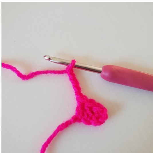
1. Lag 5 luftmasker